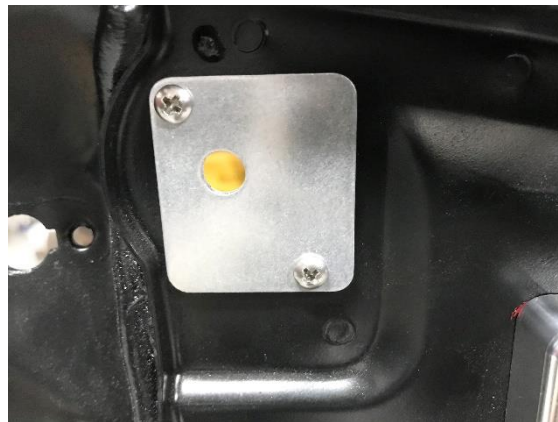
The throttle cable firewall bracket uses the factory clutch cable opening in the firewall. There is already one hole that is used to secure the factory clutch cable, so you must make another hole for the throttle cable firewall bracket. This picture was taken while facing the firewall.