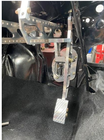
The completed throttle pedal assembly will look as shown here.

The installation of the throttle pedal is straightforward. The most important aspect of the throttle pedal assembly is the tightening of the pedal nut to the mount. You will have to find the happy medium between too tight and too loose to arrive at the proper torque setting. Aside from that, the throttle pedal is a simple, Bolt On & Go installation.