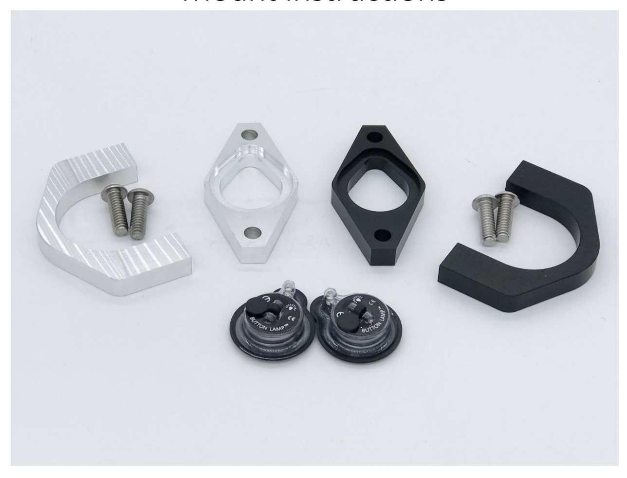
FFP Customs' Wireless LED Roll Bar Light Mount is the product you didn't know you needed. The ability to shine a bright light inside your race car is its strong point. Installing it is a breeze, but maybe you need a little assistance in making sure you have a full grasp on the product, we have you covered.

In the racing world, most of us do our best work at night. With most race cars featuring a roll cage, many times any interior lights the car would've had have been thrown out. That's great when removing weight or making room for said roll cage, but when you need to see inside the car, you are left in the dark. With these Wireless LED Roll Bar Light Mounts, you will never again be in the dark. Compatible with 1 5/8" roll bar tubing, these Wireless LED Roll Bar Light Mounts can go virtually anywhere, even in the engine compartment or trunk area where light is needed. Made from 6061 aluminum, the Wireless LED Roll Bar Light Mount comes in handy when you need to shed light on a situation. The Wireless LED Roll Bar Light Mount comes with 2 bulbs, takes no more than 5 minutes to install and are designed and manufactured in the USA.