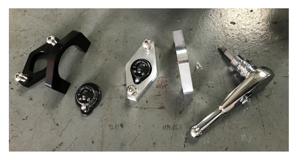
The nuts and bolts of the Wireless LED Roll Bar Light Mount is that it does not contain any nuts or bolts. Each Light Mount includes a pair of 1/4-20 \times 3/4 " Stainless Steel Buttonhead screws.